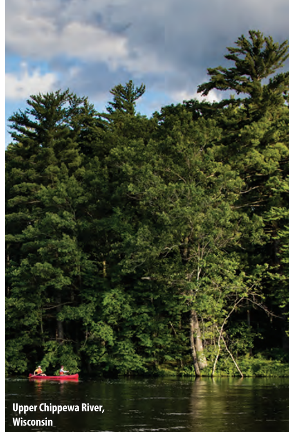
Upper Chippewa River, Wisconsin